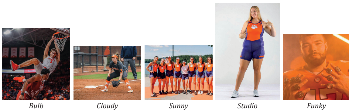
Figure 2: Examples of the five types of lighting scenarios

the difference in the readings, including the impact of luminance and saturation (Hunt and Pointer, 2011, pp. 61–68).